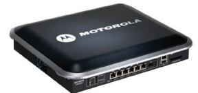
RFS 4011 available only with WiNG 5.

RFS-4011-11110-WR: RFS 4000 Services Controller with Integrated Dual Radio Access Point for Worldwide (excluding US)