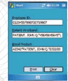
Label Printing on Windows Mobile Device