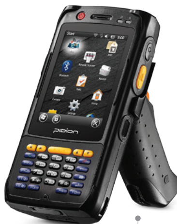
BIP-6000 MaxGrip Pistol Grip