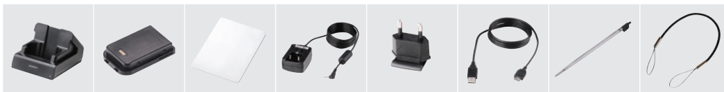
Cradle Battery Protection Film Adapter Adapter Connector USB Cable Stylus Pen Tether