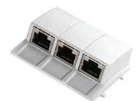
ETHERNET MODULE KT-6511-0000D-WR

For more information on how the AP 6511 can benefit your business, please visit us on the web at www.motorola.com/ap6511 or access our global contact directory at www.motorola.com/enterprisemobility/contactus